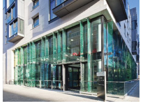
RNOH Bolsover Street

This leaflet contains information about the team who will be part of your sarcoma care. You will be cared for at either the Royal National Orthopaedic Hospital (RNOH) or University College Hospital (UCH), or possibly both.