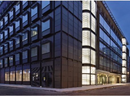
UCH Macmillan Cancer Centre